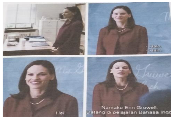
Picture 4.1 First meeting in the class